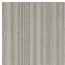
Limit 64515 LRV 23.4