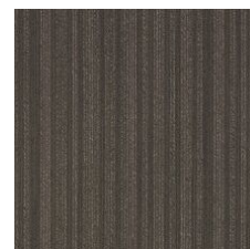
Boundary 64752 LRV 5