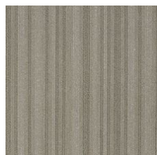
Margin 64155 LRV 16.6